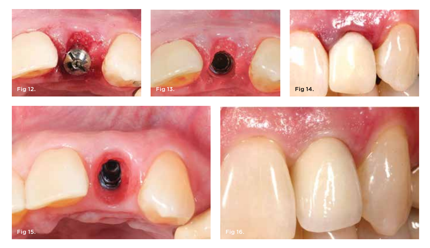
Fig 12. A healing abutment is placed and the buccal gap filled with bone graft material. Fig 13. The healing abutment is removed. Fig 14. The provisional crown is inserted on the day of surgery. Note the height of the gingiva. Fig 15. The provisional crown removed to demonstrate the ideal appearance of the soft-tissue contour prior to permanent crown insertion. Fig 16. The permanent crown after 16 months in place.

Implants should be positioned 1 mm subcrestally as viewed from the labial osseous crest to account for crestal bone resorption. In addition, to avoid an implant being pushed buccally upon insertion, it may be useful to reshape (remove) a small amount of palatal bone of the osteotomy at the crest prior to implantation. For cosmetic reasons, the platforms of immediate implants should be located 3 mm below the buccal gingival margin. This may or may not correlate with being 2 mm to 3 mm below the CEJ of the adjacent teeth if recession occurred.41 When an implant is placed 2 mm to 3 mm below the facial gingival level it is usually several millimeters subcrestal interproximally where the interdental osseous peaks are more coronal than the buccal bone level (Figure 1). Also note that a maxillary canine often tilts distally (around 11 degrees) and the root may be distally dilacerated; therefore, when replacing a maxillary first bicuspid with an implant, the implant should be placed parallel to the maxillary canine to avoid contacting the canine's apex.6