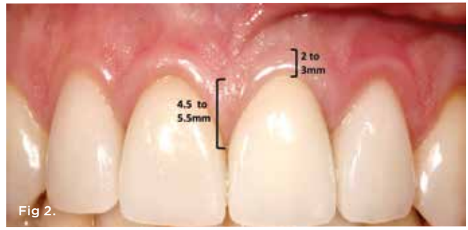
Fig 1. A skull's maxilla. The interdental osseous crest between teeth Nos. 8 and 9 is 3 mm coronal to the facial bone height. Fig 2. The buccal and lingual gingival level is located 2 mm to 3 mm coronal to the osseous crest. The interdental papilla between the central incisors is 4.5 mm to 5 mm coronal to the osseous crest. This is due to papillary hypertrophy.

when the osseous crest is >5 mm from the tip of the papilla, then extrusion or grafting (bone or soft tissue) may be needed to attain predictable papillary height.